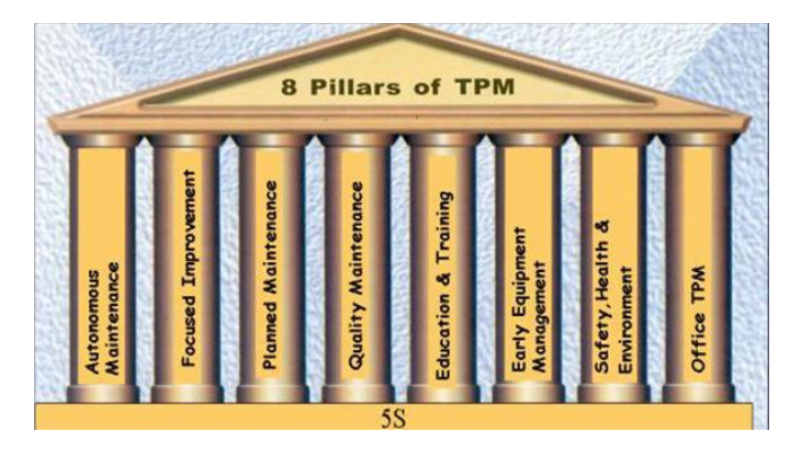
Fig -1: Pillars of TPM

8. Safety, Hygiene & Environment - The main role of SHE (Safety, Hygiene & Environment) is to establish the Safe & healthy work place where accidents do not occur [1].