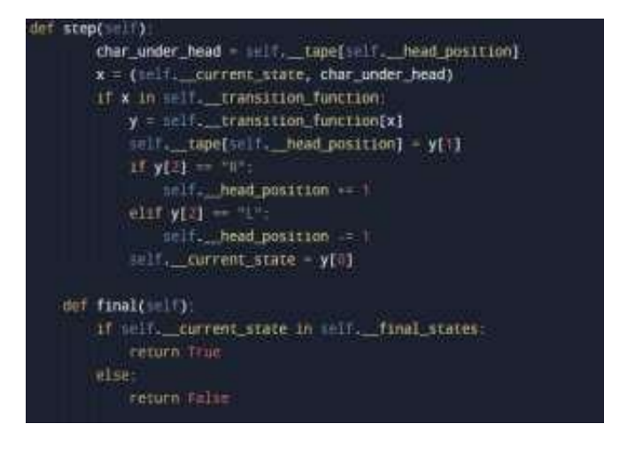
Fig-3: Actual Conversion Logic

Fig 3: shows the conversion of the input string to its 1's complement by reading the string from the tape and converting 1's to 0's and 0's to 1's.