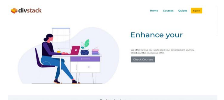
Fig -1: Landing page for e-learning project

We are testing our modifications in real time with a live server and VS-code as the code editor. Additionally, Xampp will be used to run MySql Server for the database. We'll utilize a preexisting component library, such as Bootstrap or Material You, to create the user interface.