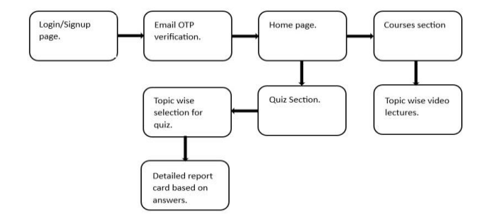
Fig -3: Flow Diagram of the project