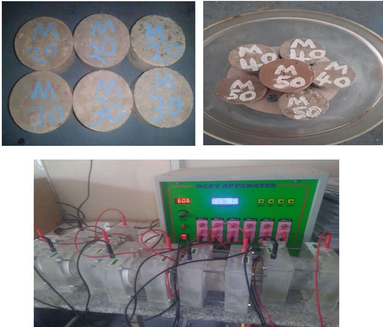
Figure 1: Rapid Chloride Penetration Test set up

To measure the electrical conductivity of the M20, M30, M40 and M50 grade control and bacterial concrete with nano silica (0%,0.5%,1%,1.5%,2%) specimens at the age of 28 days curing, the RCPT test was carried out in accordance with ASTM C1202-12. It shows how difficult it is for chloride ions to penetrate. As illustrated in Figure.1, the test entails measuring the amount of electrical charge that passes through slices of cylindrical specimens that are 50 mm thick and 100 mm in diameter over the course of six hours. Figure 1, displays the test setup for RCPT with the required settings and the RCPT specimens.