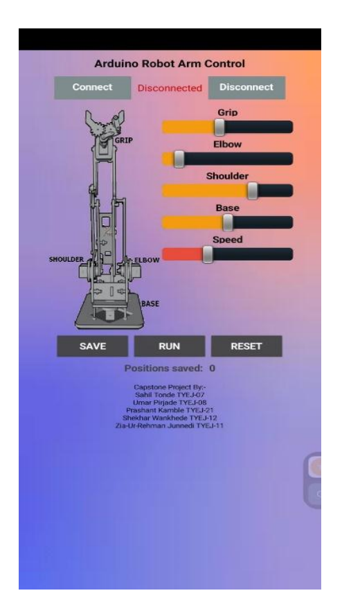
Fig -9: Control App Bluetooth Integrated

D. Running the robotic arm with complete configurations: