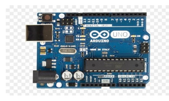
Fig 1: Arduino Uno layout

Arduino UNO is a microcontroller board based on the ATmega328P. It has 14 digital input/output pins (of which 6 can be used as PWM outputs), 6 analog inputs, a 16 MHz ceramic resonator, a USB connection, a power jack [4]. Arduino Uno can be powered through a USB connection or by an external power supply, and the power source is selected automatically. It can be operated at a voltage of 7V to 12V.