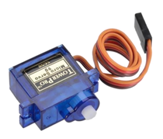
Fig 3: Servo motor

Servo motor is a DC motor with a closed feedback system in which the position of its rotor will be communicated back to the control circuit in the servo motor. This motor consists of a DC motor, a set of gear, potentiometer, and the control circuit. Potentiometer serves to define the limits of the angle of rotation servo. While the angle of the axis servo motors regulated by pulse width signal sent through the legs of servo motor cable <sup>[2]</sup>.