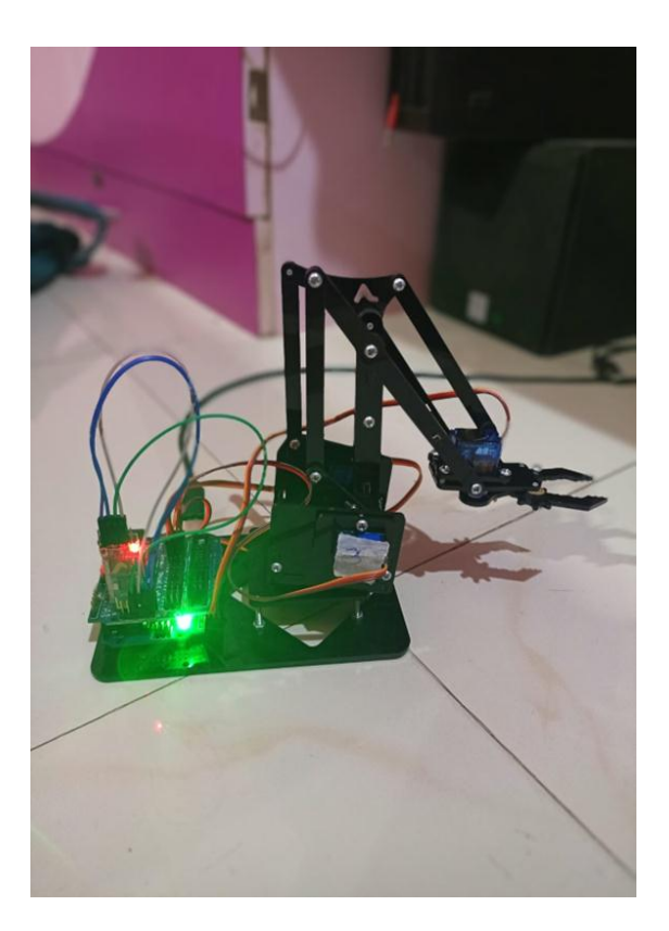
Fig -6. Actual Robotic Arm Produced