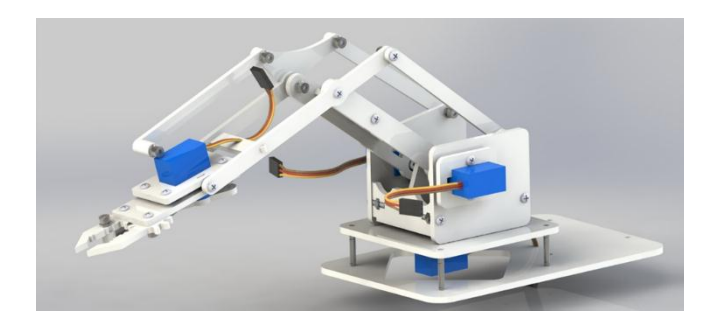
Fig -4 Configuration of Robotic Arm

In our work the robotic arm we deigned is visualized in the picture above. In this configuration we have 4 Degrees of Freedom, named Base, Shoulder, Elbow and Gripper. Each joint is rotated or given an angular adjustment using servo motor, Servo Motors are electromechanical devices which converts the electrical energy into angular mechanical energy.