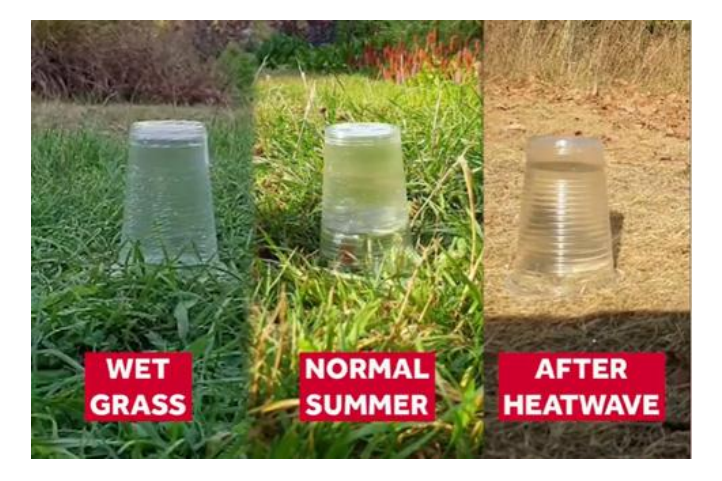
Figure 1: Effects of heatwaves on ground's water table

study the experiment conducted by Dr. Robert Thompson from the University of Reading's Department of Meteorology in the UK. This experiment demonstrates the dangerous effect that heatwaves can have on the ground's water percolation rate. In this experiment, a glass of water was upturned on wet grass, moist grass and parched grass. Wet grass took nine seconds to absorb the water, moist grass took 52 seconds and parched grass took approximately 15 minutes. The water given to the parched grass was also prone to puddling on top of the ground, rather than being absorbed into it. By comparing the time taken by each glass, the experiment demonstrates how heavy rainfall in a area with less to no vegetation can be hazardous and lead to flash flooding.