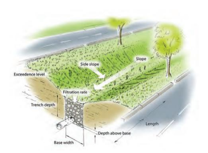
Figure 2: Bioswale and its components

Design of Bioswales: Bioswales are usually trapezoidal or parabolic shaped channel which is designed to treat and infiltrate incoming storm water. This water is used to help direct large storm water flow volume from a large catchment area to a connected discharge point and further to a bioswale. The maximum design capacity of a bioswale is of drainage areas up to 1 acre. The ideal design of bioswale has 1 to 2 percent slope up to maximum 5 percent. Check dams can be used in case of steeper slopes in order to reduce storm water velocity and prevent erosion. The filter media used in the bioswale is a blend of loam, sand, and compost specifically engineered to meet the required infiltration rates and porosity needed for storm water filtration and enhanced water quality for supporting plant life in bio retention areas.