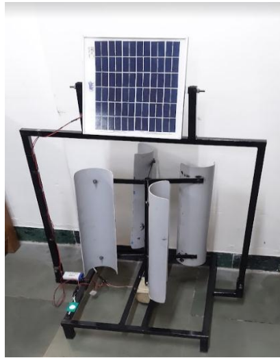
Fig.-Working model of Solar and wind turbine Hybrid system

lessen the demands placed on those generators while they are generating. The choice is to store power in storage mechanisms like batteries and then discharge it evenly.