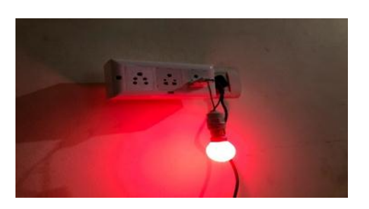
Fig -3: smart switch on condition