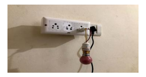
Fig -2: smart switch off condition

A smart switch that made it easier for the mobile application and the actual device to connect and communicate Future home automation technologies.