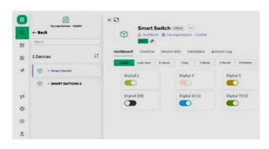
Fig-4 -Blynk Console