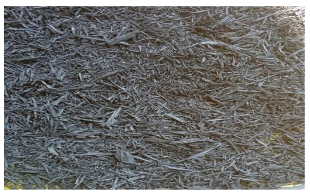
Fig -4: Tire Rubber Crumb