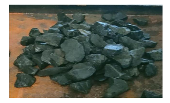
Fig -2: Coarse aggregate

2 Coarse Aggregate: The aggregates which is retained over IS Sieve 4.75 mm is termed as coarse aggregate.