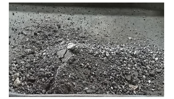
Fig -3: Fine aggregates

3 Fine Aggregate: The aggregate passing from 4.75 mm and retained on 75\mu mm IS sieve.