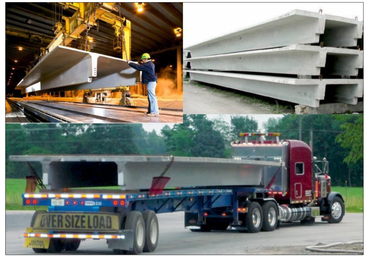
Figure 4 : DT member fabrication, stripping, storage and transport (PCI MNL-120-17)

A Double Tee (DT) is a beam-slab member that is made of two stems and a flange slab. Precast DT members are highly optimized, tried, tested and very popular in many countries. The design and construction of beam slab systems using these members is well documented. PCI provides standard geometry, reinforcement, loads and designs for these members for both totally precast members. These members can also be designed with about 1-3 inches (or 25-75mm) thick layer of cast-in-place field concrete topping on precast double tee members. The cast-in-place topping ensures composite slab strength, durability and water tightness to the system. However, these standard designs and details are all tailored to North American markets and are not relevant for use in Indian markets as housing floor slabs members.