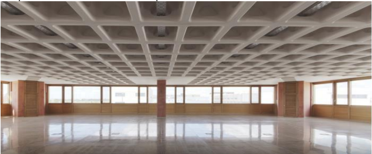
Figure 3 : Waffled floor slabs [3]

Waffled slabs are thin slabs spanning between ribs that are spaced at regular intervals. The ribs provide the necessary strength and stiffness to the slab system. As such waffle slabs provide great reduction in concrete volume and weight of the slab members. The reduction in concrete volume means reduced amount of steel reinforcement. These slabs are an economical option while providing a similar level of strength and serviceability as solid slabs. The figure 3 below shows a waffled slab floor system that reported a 55% less concrete volume compared to that of solid slab.