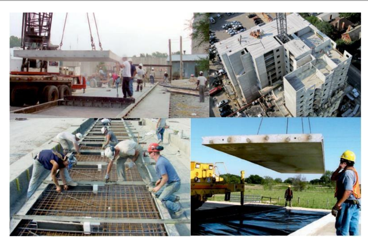
Figure 1: Precast solid slab stripped out of precast bed (top left), precast building erection (top right), tying reinforcement on the form bed in plant (bottom left), erection of slab at job site (bottom right), Picture from PCI 8<sup>th</sup> Edition [2]

International Research Journal of Engineering and Technology (IRJET)Volume: 10 Issue: 07 | July 2023www.irjet.net