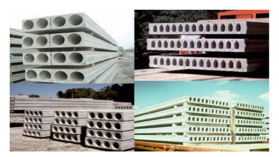
Figure 2: Precast hollow-core slabs stacked at yard and jobsite, PCI, 2017 [2]

The hollow-core slabs are a great option for floor slabs in housing units. Being light in weight, they increase structural efficiency of the members and carry higher loads than traditional solid slabs. Quick design tables make it easy to design and fabricate these members in a short notice. These are popular floor slab choice in many countries. Combined with cast-in-place topping, various structural span arrangements are possible with these hollow-core slab systems.