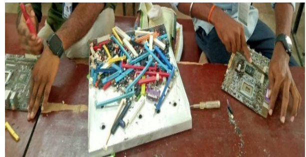
Fig - 4: CLEANING OF MOTHERBOARD

The components of resistors, capacitor, copper, slots, processor, battery and other components are present on the surface of board. The components are present in board is not to be appearance of tile to be seen. First the components are to be removed and the plain board will to be get.