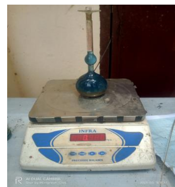
Fig - 11: SPECIFIC GRAVITY OF CEMENT