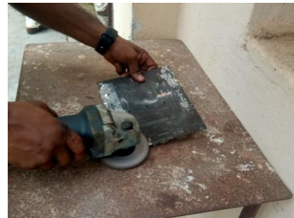
Fig - 5: SMOOTHENING OF BOARDS

After the process of cleaning the board is visible and appearance in rough surface in both sides. So the smooth surface by the equipment of grinding machine used, Emery sheet by use handmade to this work for shine.