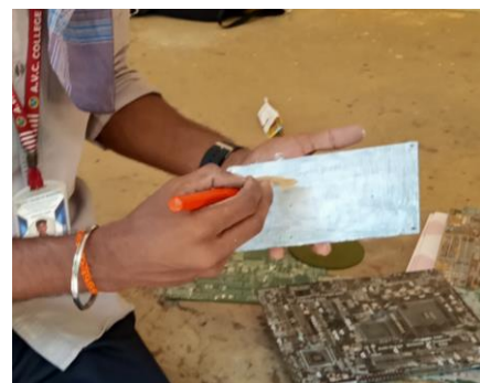
Fig - 6: PRIMER COAT