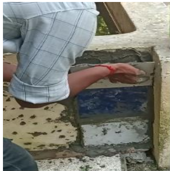
Fig - 7: FIXING THE TILES