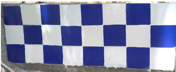
Fig - 8: FINAL FINISH