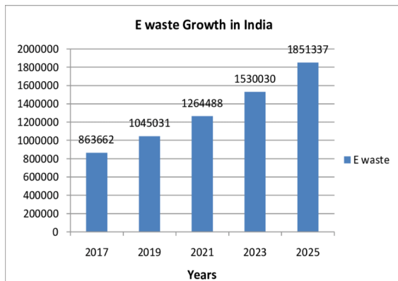
Fig – 1: YEARWISE E-WASTE GROWTH IN INDIA