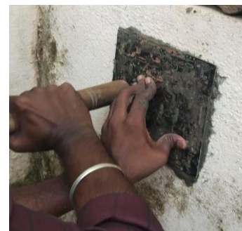
Fig - 10: BONDING TEST

Normally wall tiles are bonded with wall by using cement mortar of ratio 1:2 as per IS code 13630. As same as E-waste tiles also bonded with CM 1:2, the quality of bonding is exposed by this mix ratio when compared to normal tiles bonding. Before placing the tiles, the area should be patched for better bonding result.