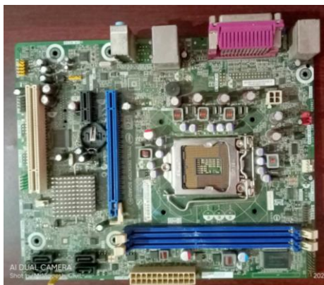
Fig - 3: MOTHERBOARD

Availability of motherboard as a waste in enormous quantity present in local computer service centres. We having a 25 numbers of waste motherboards collected from local shops. A small quantity of e waste motherboard is collected for research purpose when it to be success will collect in more quantity to our project.