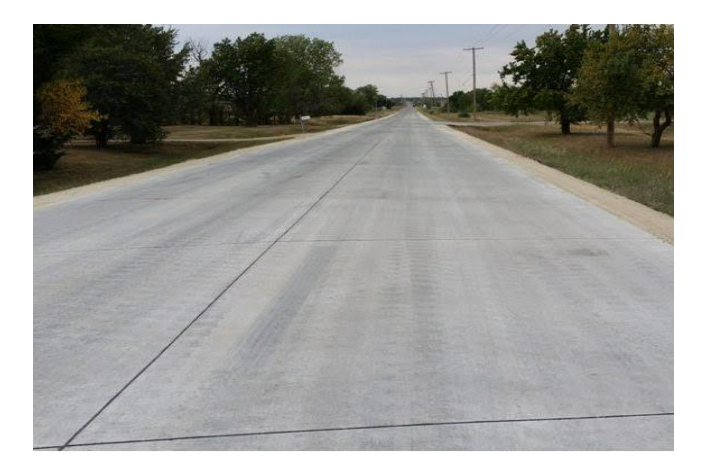
Figure-03: Rigid Pavement.

Concrete is the primary material used in rigid pavements. Rigid pavements are constructed with reinforced or unreinforced concrete slabs, typically supported directly by the subgrade or a thin base layer. They offer excellent loadbearing capacity and durability but are less flexible than asphalt pavements, making them more susceptible to cracking under certain conditions.