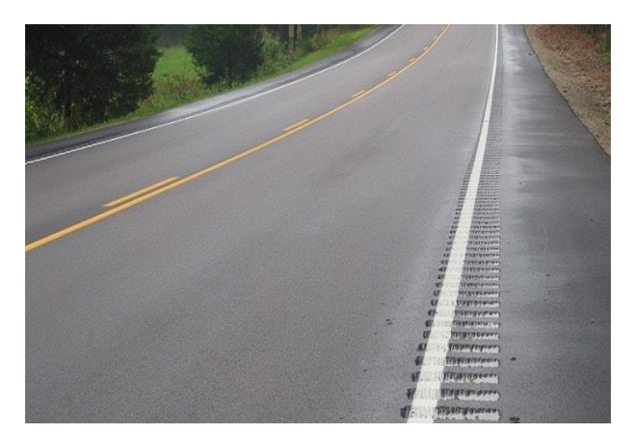
Figure-02: Flexible Pavement

Asphalt concrete, often referred to as asphalt, serves as the principal material in flexible pavements. These pavements are comprised of layers of asphalt mixtures laid atop a compacted base and subbase. Flexible pavements possess the ability to tolerate minor movements and deformations without developing cracks, rendering them suitable for diverse traffic loads and climates.