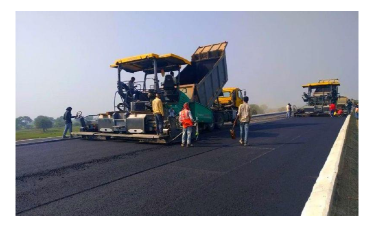
Figure-01: Highways Pavement.

Highway pavement denotes the uppermost layer of a road constructed to endure vehicle loads and furnish a durable, even driving surface. It typically comprises multiple layers, each fulfilling a distinct role to guarantee the road's durability and functionality. These layers commonly encompass the subgrade, subbase, base course, and surface course. The subgrade refers to the natural soil or prepared earth beneath the pavement layers, furnishing support and stability. Above the subgrade, the subbase layer is incorporated to further distribute loads and facilitate drainage. Following the subbase, the base course is installed to offer additional structural support and aid in load distribution. Lastly, the surface course, also recognized as the wearing course, constitutes the topmost visible layer to drivers. It's engineered to withstand traffic wear and environmental factors while delivering a smooth, skidresistant driving surface. Highway pavement construction employs various materials, including asphalt concrete (commonly known as asphalt), concrete, and composite materials. Material selection hinges on factors such as traffic volume, climate conditions, and budgetary constraints. Regular maintenance and periodic resurfacing are imperative for extending the lifespan of highway pavements and ensuring the safety and efficiency of road transportation systems.