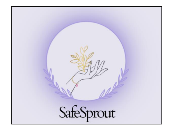
Fig. 1: Logo of SafeSprout

Female students in pursuit of higher education encounter a myriad of obstacles, navigating the demanding terrain of academic life while embarking on a journey of personal growth and development. Yet, a pervasive and disconcerting challenge that looms large over the hallowed grounds of colleges and universities is the pressing issue of safety and security. Incidences of harassment, violence, and personal safety apprehensions have ominously marked the educational path of countless women. [7] The need to confront these formidable challenges and usher in an era of enhanced campus safety is undeniable. And here, we introduce 'SafeSprout' - a beacon of hope, a pioneering response to these formidable challenges. This revolutionary application, powered by cutting-edge technology, redefines safety for women in academia, providing prompt, proactive, comprehensive solutions to tackle these pressing issues head-on. 'SafeSprout' is not just an application;[2] it is a digital renaissance, an empowering force for women, and a catalyst for community-wide responsibility. It instills confidence and serenity in the fabric of campus life.