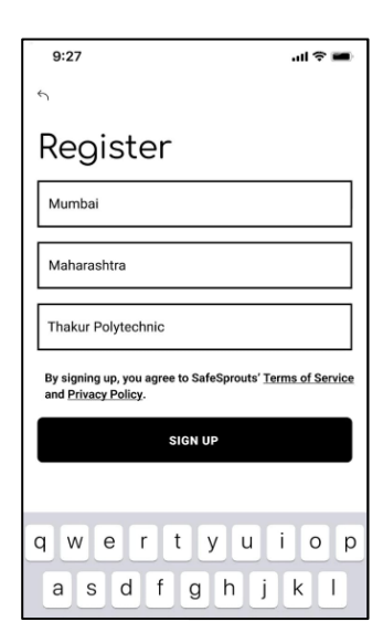
Fig. 4: College Registration