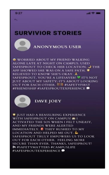
Fig. 8: Survivor Stories

Ex: Survivors of incidents like harassment or assault can share their stories to inspire and provide strength to others who may have experienced similar situations.