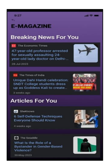
Fig. 9: E-Magaine

Ex: Students can leave reviews based on their interactions with campus security, encouraging transparency and accountability.