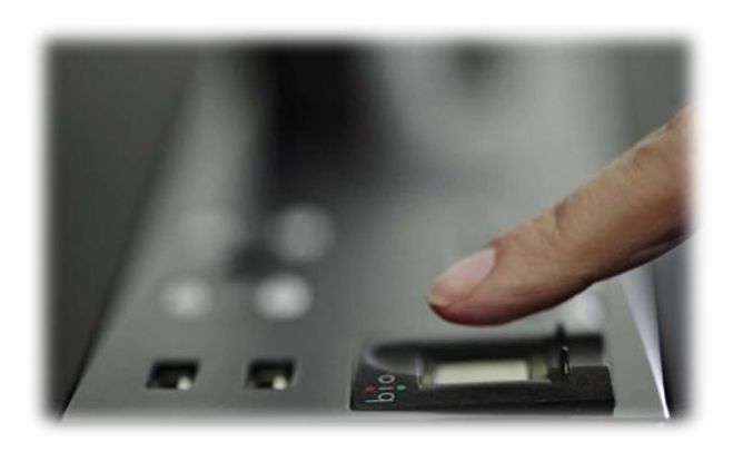
Fig 1:- UID sensor

Some types of biometric sensor require more specialized hardware than others. For example, face biometrics only require a device with a user-facing camera – which a large section of the population has access to given the momentous rise in smartphone usage. Other types, such as fingerprint biometrics, require specialist technology like fingerprint readers, which are only available to those with certain hardware or specific smartphone, tablet, or laptop models.