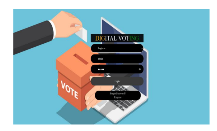
Fig 2:- Interface of Digital Voting