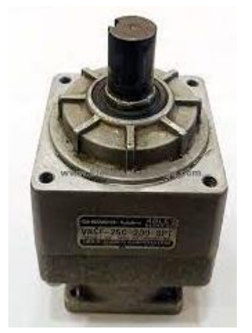
Fig -9: Gearbox