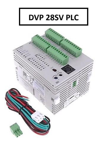
Fig -1: DVP 28SV PLC

The DVP 28SV PLC was selected due to its compatibility and tailored functionality for seamlessly integrating with load cells in our automation setup. Its specialized input modules or analog input channels are designed to efficiently interface with load cells, offering high-resolution analog-to-digital conversion for precise signal acquisition. Additionally, these modules incorporate advanced features like filtering and calibration to enhance the accuracy and reliability of load cell signal measurement. By leveraging these capabilities, the PLC facilitates seamless integration of load cell functionality into our automation system, ensuring accurate and dependable performance in monitoring and controlling load-related processes.