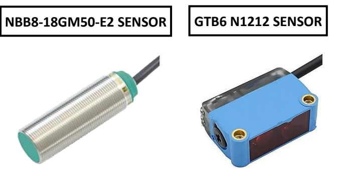
Fig -10: Sensors