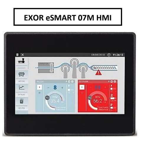
Fig -4: EXOR eSMART 07M HMI

The integration of a single Human-Machine Interface (HMI) device instead of separate display and keypad components streamlines user interaction and reduces hardware complexity. This consolidated approach optimizes space utilization and simplifies wiring, resulting in a more efficient and cost-effective control system design. Additionally, the unified HMI provides a cohesive user interface, enhancing user experience and facilitating intuitive operation within our automation setup.