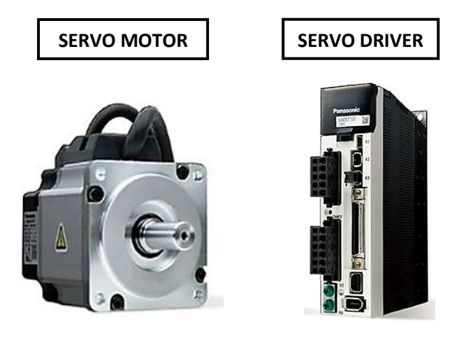
Fig -5: 200W Servo Motor Fig -6: 200W Servo Driver

The selection of the Panasonic 200W 3000rpm servo motor was driven by the requirement for precise shaft rotation in our application. Integrated with a PLC, it facilitates accurate control over the motor's angular position, enabling precise positioning and stopping at specific angles. With its rated power and rotational speed, the Panasonic servo motor offers the necessary torque and velocity capabilities to meet our rotational degree specifications. This servo motor's highspeed operation and accurate feedback system ensure reliable performance, meeting the stringent demands of our automation system for precise motion control.