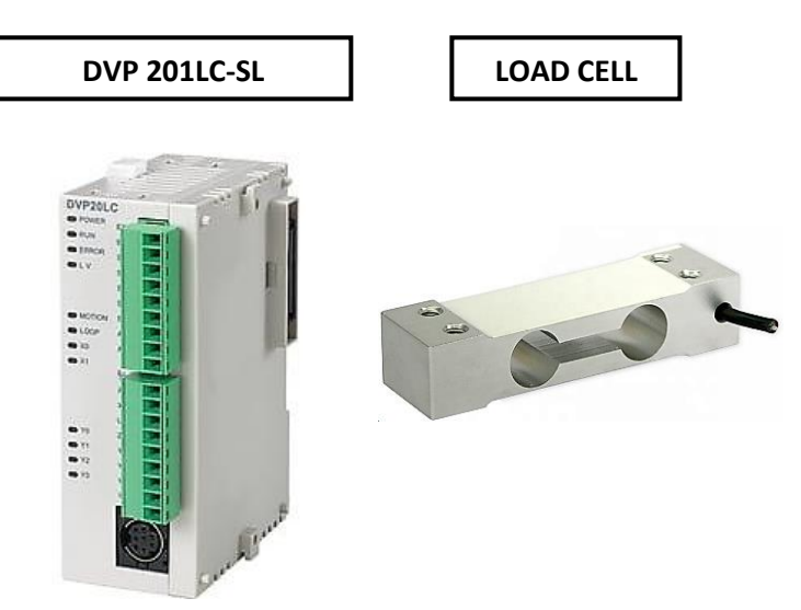
Fig -2: DVP 201LC-SL

The DVP 201LC SL load cell module was chosen for its compatibility with the DVP 28SV PLC and its specialized capability to interface with load cells. Featuring dedicated analog input channels, it ensures accurate signal conditioning and processing of load cell outputs, enabling precise measurement of force or weight. Integrated seamlessly into the PLC programming environment, it enables precise control and monitoring of load-related processes within our automation system.