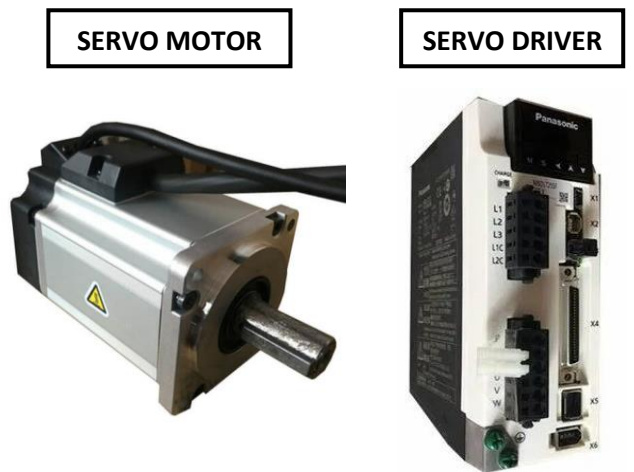
Fig -7: 400W Servo Motor

The selection of the Panasonic 400W 3000rpm servo motor with gearbox was necessitated by the specific requirements of our application, which involved the operation of an arm and a crank mechanism. The addition of the gearbox serves to reduce the rotational speed of the motor while increasing torque output, enabling efficient operation of the arm and crank system. Without the gearbox, the motor would be subjected to hunting, causing instability and inefficiency in motion control. Additionally, the choice of a 400W motor over a 200W motor was driven by the need for increased power to effectively drive the load and ensure smooth and precise movement of the mechanism. This configuration optimizes performance and reliability, meeting the demanding requirements of our application.