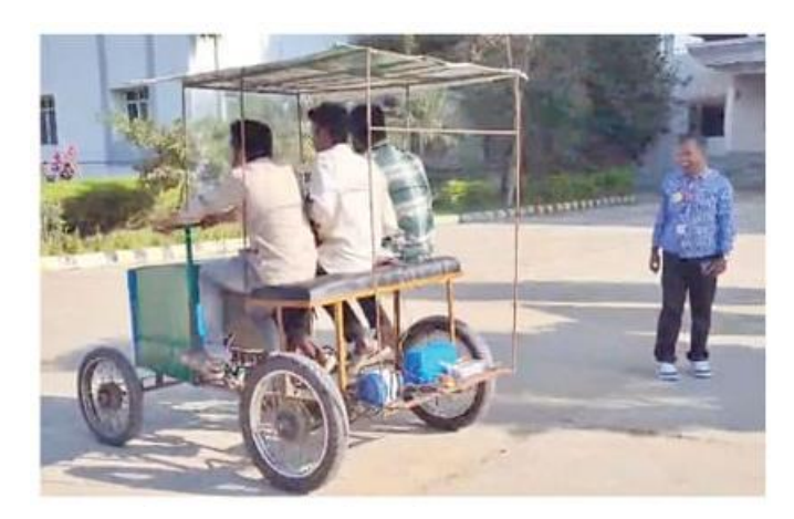
Figure 3. Running condition of the vehicle