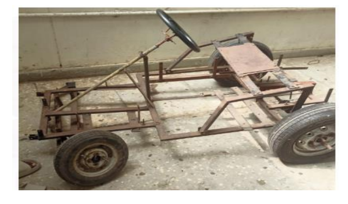
Figure 1: Skeleton of the vehicle

Everything can be reused now a days. So in a real sense we can say that nothing is a real waste. Everything has their value in this world. In this work we used waste material hollow iron pipes design of chassis. Double pedal operated car four seated capacity while peddling operation batter charged. Battery capacity (18 Ampere hour, Watts - 1000, Volts - 48).