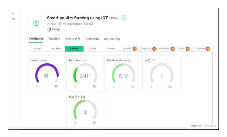
Fig3-: Blynk Cloud Visual Representation of Data

Using the Blynk Cloud platform, data from the ESP32 microcontroller can be securely sent to the cloud for storage and analysis. This enables real-time monitoring and control of IoT devices, facilitating the development of smart applications for various industries, including agriculture, healthcare and home automation.