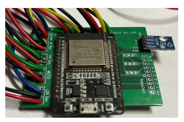
Fig-2: Controlller Board PCB.

The Blynk app is configured to provide a user-friendly interface for remote monitoring and control. Users can view real-time data, receive notifications and manually control the device through the app. In addition, automation rules are set in the Blynk application, which ensure trouble-free operation without constant human intervention.