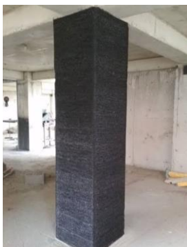
Fig -2 b) BFRP used on column