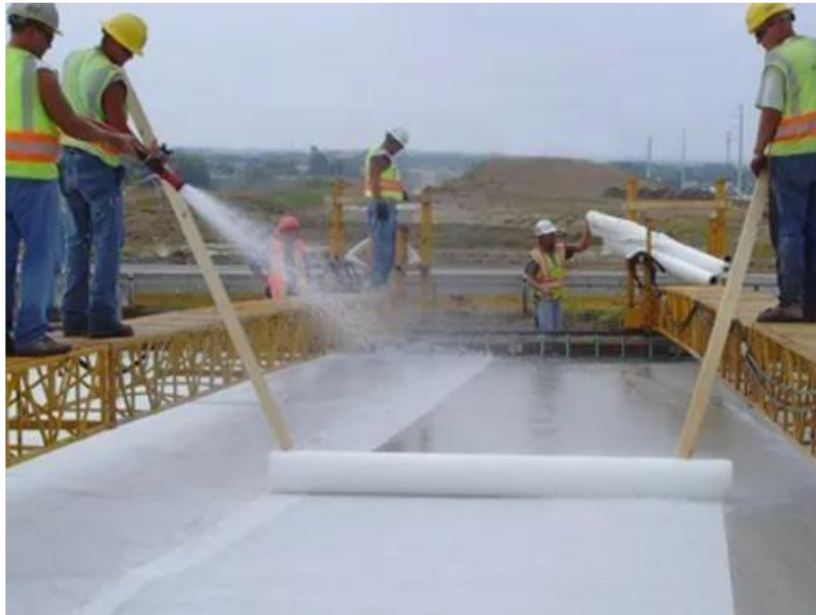
Figure 5.3 Membrane curing procedure.

and plastic covering thus are used as sheet in this place technique. This is still refer to as sealing compound. In sheet helping cure, concrete substance advantage is inferior the factual moisturizing methods.