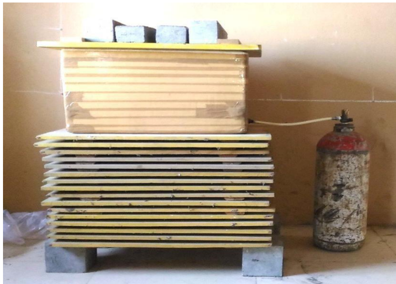
Figure 2.1 Air tight container for curing of CO2.