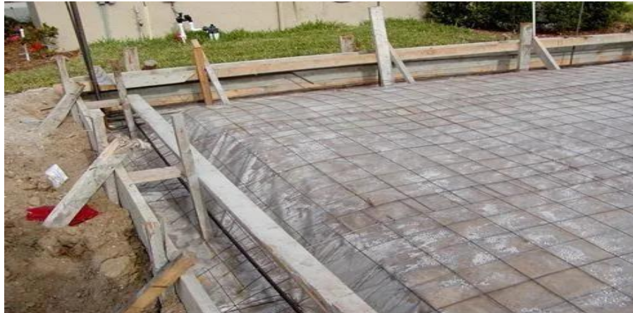
Figure 5.5 Sealed curing procedure.