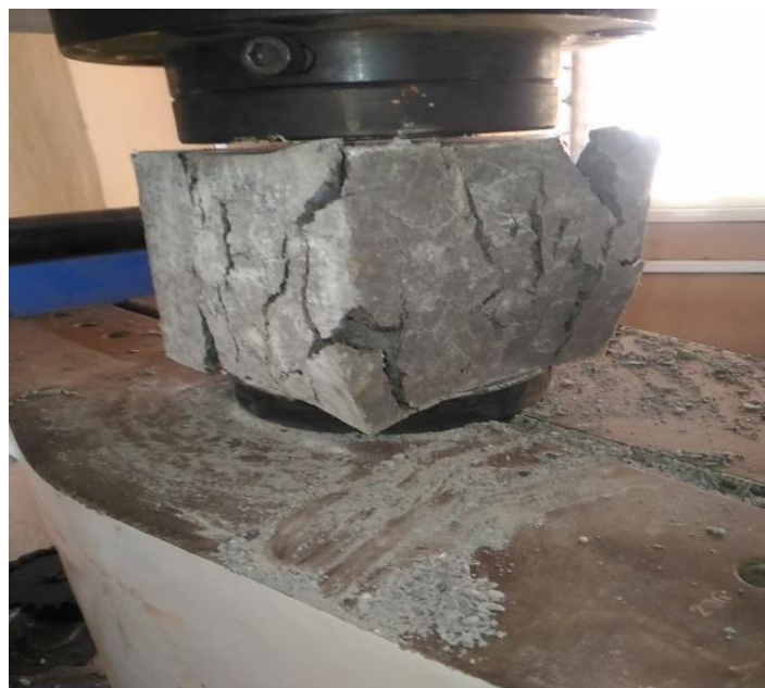
Figure 2.3 Compression strength testing process