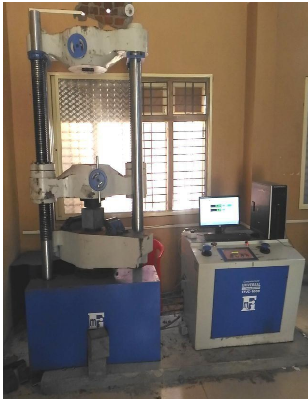
Figure 2.2 Compression testing machine(CTM)