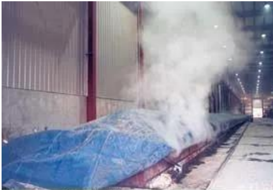
Vapor curing of structural beams