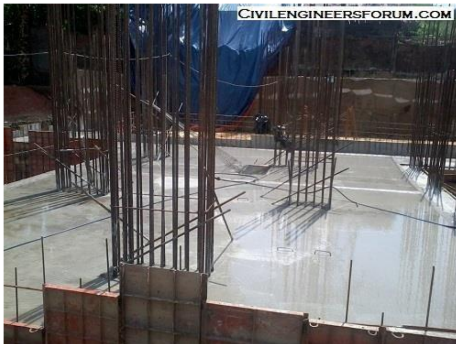
Figure 5.2 Ponding curing procedure.

Ponding technique a favorite and usual concrete helping cure method. Concrete is healed by way of putting water on the level aircraft that is, rod, ceiling, path thus. After hardened casting, the floor is covered accompanying picture. After 24 hours, the art is detached and water is filled out small four-sided panels. A edge is likely thoroughly of the 4 facets because the water cannot go with the flow and stocked because the actual below the water is healed properly. Ponding helping cure arrangement is better than the remainder of something but it enhances troublesome to smooth after helping cure is achieved.