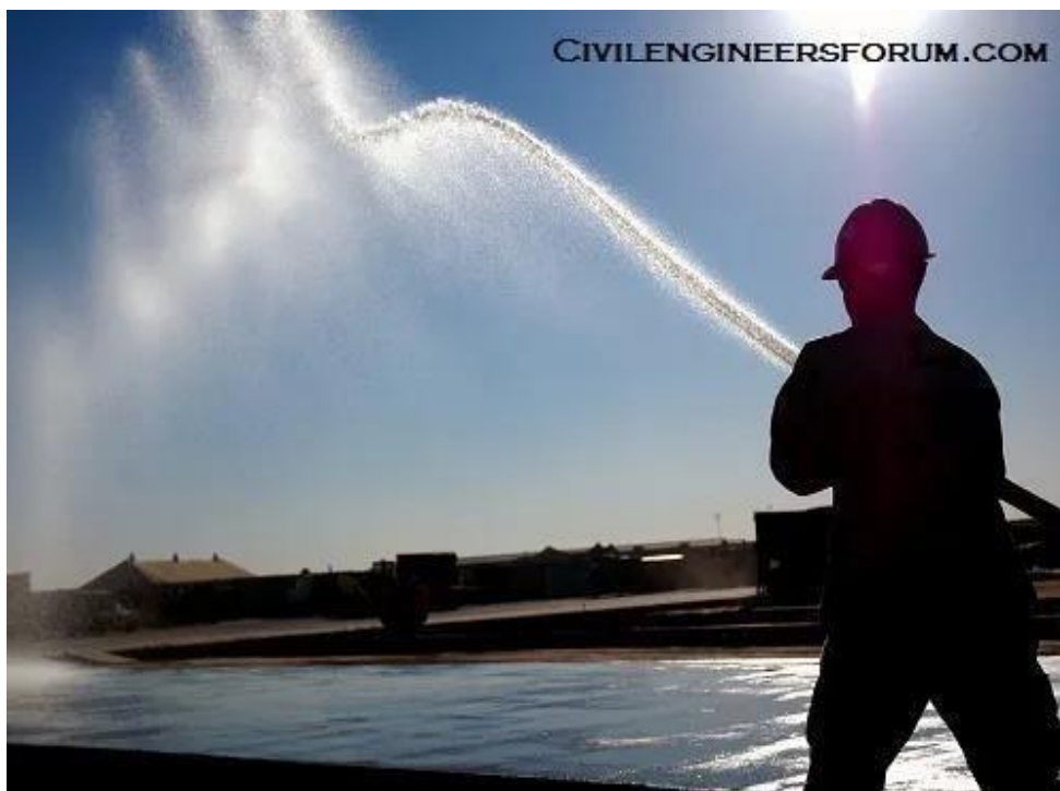
Figure 5.1 Sprinkling curing procedure.

This factual helping cure approach demands big bulk of water. In this technique, water is completed activity to the hardened later an c language momentary. The water need expected steadily used in order that the hardened does wet out.