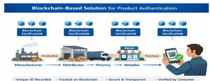
Fig -1: Blockchain verification for product authenticity

Counterfeit products are a major issue affecting industries worldwide, causing enormous financial losses and posing health and safety risks, especially in sectors like pharmaceuticals and electronics. Traditional methods of verifying authenticity, such as barcodes and serial numbers, are often easy to forge, while manual inspections are time-consuming and prone to error. Tracking counterfeit items throughout the supply chain is extremely difficult due to a lack of transparency among suppliers. Consumers often cannot differentiate between real and fake products, which reduces trust and damages brand value. Companies spend significant resources on anti-counterfeiting campaigns, while governments and regulatory bodies struggle to enforce product authenticity. E-commerce platforms also face challenges detecting fake products online, and cross-border trade adds complexity to tracking genuine goods. These challenges highlight the urgent need for a secure, reliable, and transparent system to ensure product authenticity. Blockchain technology emerges as a potential solution, offering a way to efficiently overcome these issues and protect both businesses and consumers.