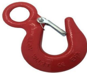
Figure 3. Hook

The hook is an important component of the hydraulic floor crane used to hold and lift the load safely. It is attached to the end of the boom arm with the help of a chain or shackle. The hook is usually made of high-strength forged steel to withstand heavy loads without bending or breaking.