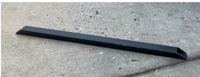
Figure 5. Boom (or) arm

The boom is the main lifting arm of the hydraulic floor crane used to raise and support the load. It is usually made of strong steel or mild steel to handle heavy weights without bending. One end of the boom is connected to the vertical support column, while the other end carries the hook and chain used to hold the load.