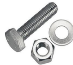
Figure 5. Nut & Bolt

The nut and bolt are important fastening components used in the fabrication of a hydraulic floor crane. They are used to join and secure different parts of the crane, such as the base frame, boom arm, support column, and other structural components. Proper tightening of nuts and bolts ensures the stability, safety, and durability of the hydraulic floor crane structure.