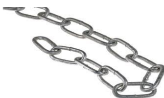
Figure 4. chain

The chain is an important component used to connect the load to the hook in a hydraulic floor crane. It is typically made of high-strength alloy steel to safely support heavy loads. The chain helps secure the load to the crane and allows for slight flexibility during lifting.