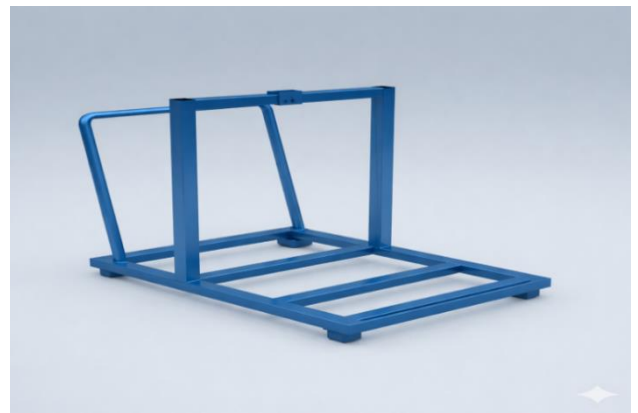
Figure 1. frame

The base frame is the main supporting structure of the hydraulic floor crane. It is usually made of strong mild steel to provide stability and strength. The base supports all other components of the crane and helps distribute the load evenly. It also holds the wheels that allow the crane to move easily on the floor.