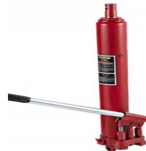
Figure 2. Hydraulic jack

The hydraulic jack is the main lifting mechanism of the crane. It works on the principle of Pascal's Law. When force is applied to the jack handle, hydraulic pressure is created inside the fluid, which moves the piston and lifts the boom arm along with the load.