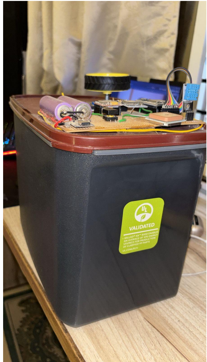
Actual Image 4.2