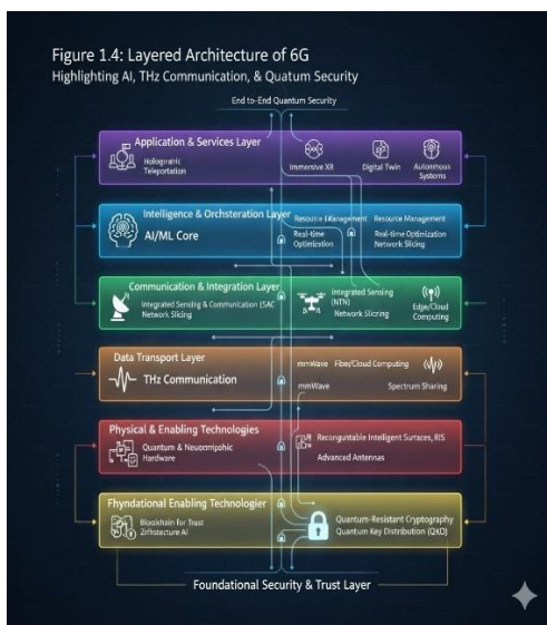
Figure 1.2: Integrated roles of key technologies in the 6G architecture.

This transformation is enabled by the convergence of advanced technologies such as artificial intelligence-driven network management, quantum communication for enhanced security, terahertz spectrum for ultra-fast data transmission, and edge computing for real-time processing. These technologies collectively allow networks to become self-optimizing, adaptive, and capable of handling complex, large-scale data environments. The integration of these key technologies in sixth-generation architecture is shown in Figure 1.2.