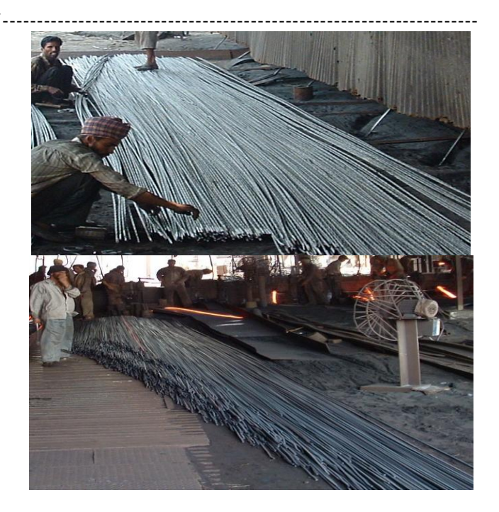
Fig -1: Iron rods of varying diameters, TMT, Patti, and L-strips.

These re-rolling mills are located in India. Clusters are located in Mandi Gobindgarh, Ludhiana & Khanna in Punjab, Calcutta, Bhavnagar in Gujarat, Nagpur & Nasik in Maharashtra and Jaipur in Rajasthan. In Punjab itself there are about 300 re rolling mills having various production capacities mentioned below: