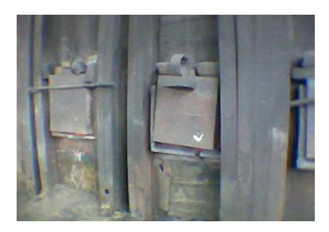
Fig -3: Doors used in the furnace

(b) Doors: The furnaces are provided with a number of inspection doors, besides the charging and extraction doors as shown in Fig 3.