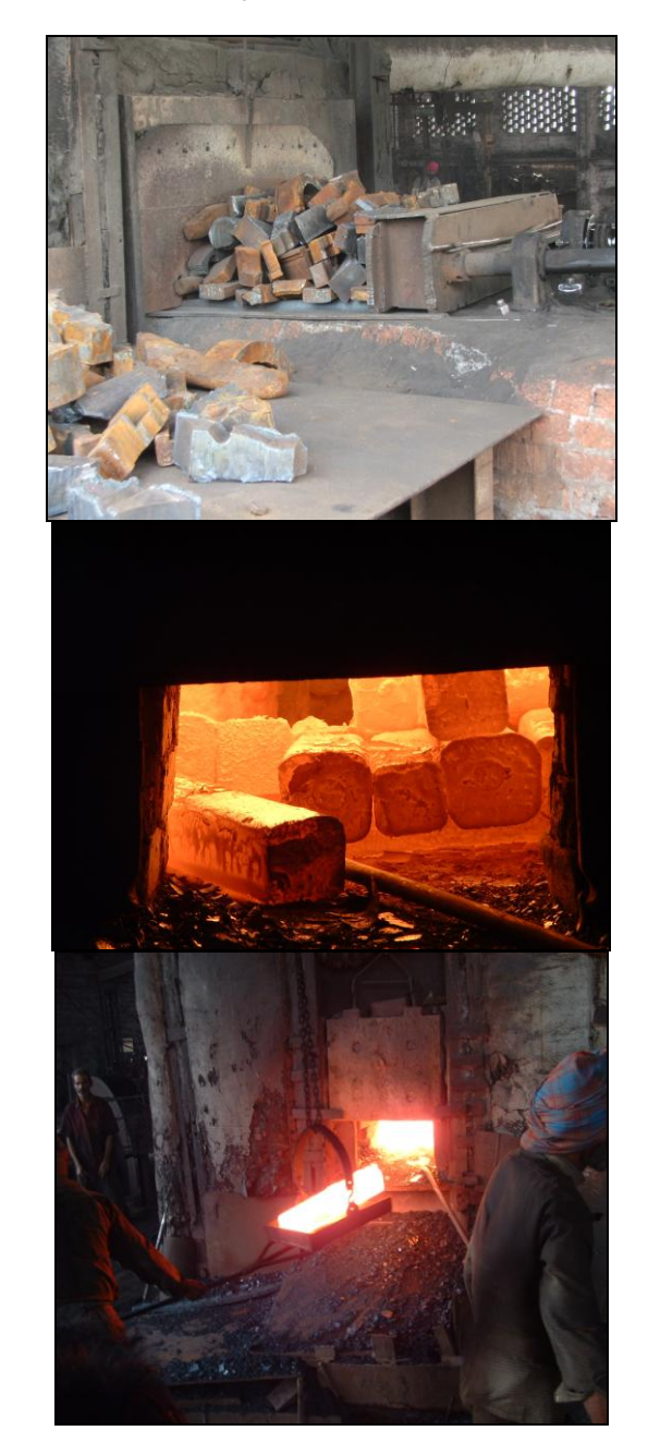
Fig -2: Raw material Charging and Discharging in a Reheating Furnace

(a) Charging and Discharging Method: The furnaces practice back charging and side discharging method. These are shown in Fig 2