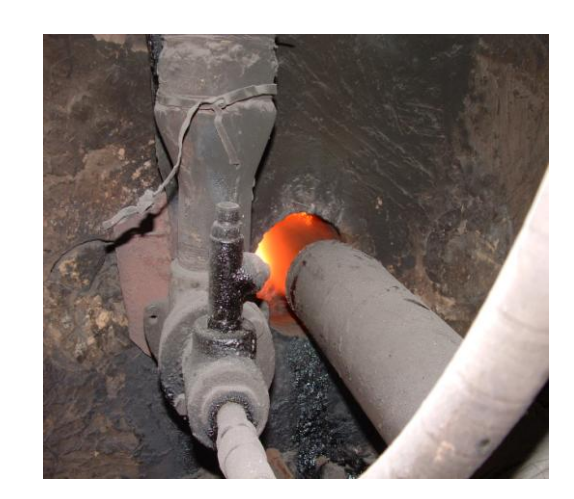
Fig -7 : Hollow pipe used as burner

(e) Burner: A Burner used in pulverized coal fired reheating furnaces is a simple hollow pipe as shown in the Fig 7 \,