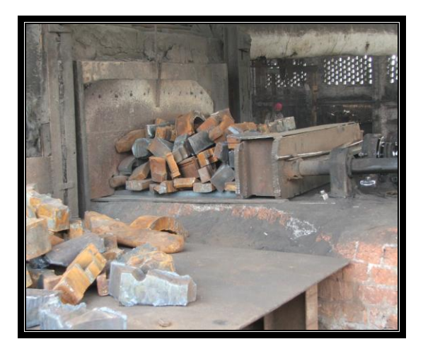
Fig -4: Overloading Hearth of Furnace

(c) Hearth of the furnace: The hearth of the furnace is either under loaded or overloaded as shown in Fig 4. In both the cases excessive energy per unit of production is used. The furnace should be properly designed and its hearth must be properly loaded[4].