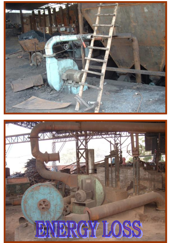
Fig -6: Energy Intensive practices

International Research Journal of Engineering and Technology (IRJET) e-ISSN: 2395-0056 Www.irjet.net p-ISSN: 2395-0072