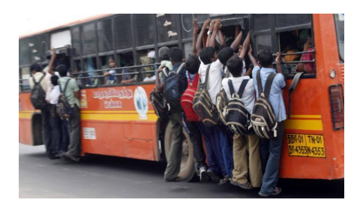
Fig 3.2. Unsafe transportation in Cities.

International Research Journal of Engineering and Technology (IRJET)e-ISSN: 2395 -0056Volume: 03 Issue: 02 | Feb-2016www.irjet.netp-ISSN: 2395-0072