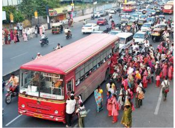
Fig 3.1.Unnessary crowding at bus stop.

Also people can come to know about the information regarding buses by just accessing internet from anywhere.