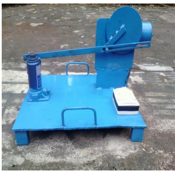
Fig-3 Fabricated electro hydraulic system

The electro hydraulic jack system was painted in order to avoid rusting and corrosion. The fabrication of the model was completed successfully. The hydraulic jack was checked and tested with a Hyundai santro. The result was successful.