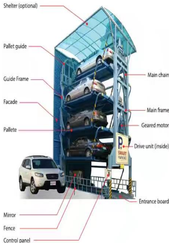
FIG 1:- Assembly of multistage car parking-system.