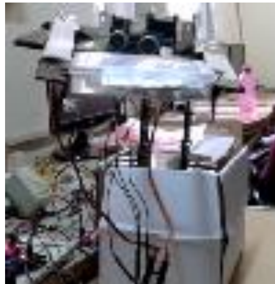
Fig- 2 Robotic Arm in action.

The Robotic Arm was timed according to the user requirements and was observed to provide the medicine on time to the patient. The patient was alerted through an alarm before the medicine was to be taken.