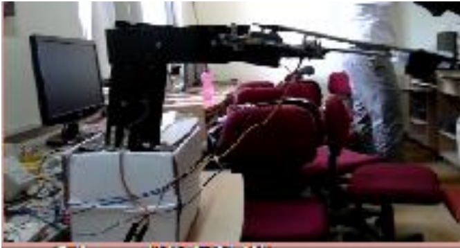
Fig-3 Robotic Arm Snapshot

This basic system can be greatly improved in the future by adding a user alert system in case the patient forgets to take the medicines. The arm can also be programmed to keep track of daily activities such as sounding an alarm when it is time to take food and medicines.