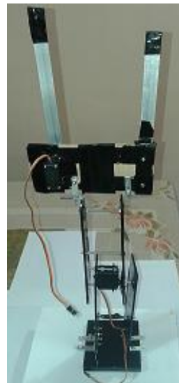
Fig- 1 Basic Robotic Arm Setup

Arduino Uno is used to interface with the servo motors, HCSR04 obstacle detection sensor. The robotic arm is operated by the servo motors. The motor controlling the gripper picks up the medicine box when prompted by the Arduino. It then hands over the medicine box to the patient. The obstacle sensor ensures that the medicine box is picked up by the patient and returned back within a certain timeframe. If not, then it assumes that the patient may not have taken the medicine and rings an alarm to notify the patient. Once the patient takes the medicine and hands back the box, the gripper places the box in its respective place and initiates the next round of assistance.