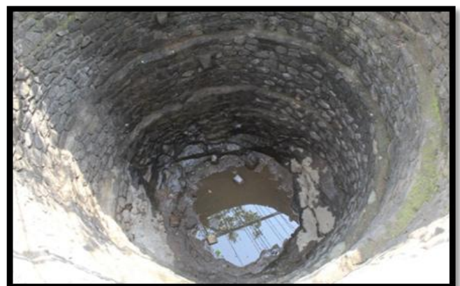
Fig 7: MARCH 2016