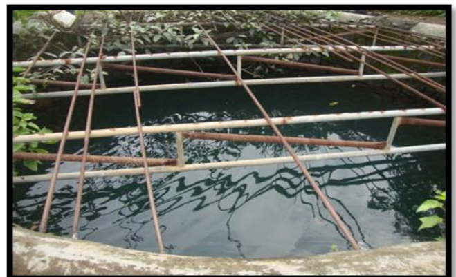
Fig 6: JUNE 2015