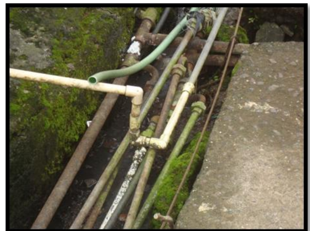
Fig 9: WATER PIPE LINES IN SEWER LINES

In the main village some of the houses have the pipeline scheme of year 2002. But water hardly is there which cannot even satisfy drinking needs as well. People who can afford to dig bore wells have satisfied themselves with it but some people are still dependent on existing pipe line systems. Some people in order to receive more water attach pumps to pipe lines which is not legal. Due to this water pressure to other person gets automatically reduced. There's no proper distribution of water. The water pipe lines are been provide within the drainage lines.