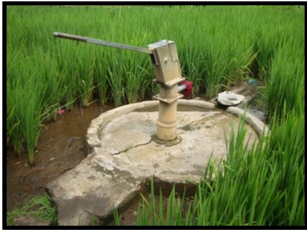
Fig 8: 13 YEAR OLD HAND PUMP PROVIDED BY PANCHAYAT

No pumps or any other arrangements have been made on the wells. People here have to carry water on their heads to their respective homes.