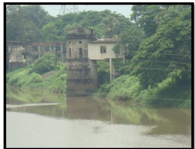
Fig 2: JACKWELL AT KUMBHE VILLAGE

2002-AT PRESENT -After the failure of the previous scheme and due to increase in the population of the same villages a new water supply scheme was proposed in year 2002. This scheme was designed for a population of 50000 souls of the above mentioned villages. This scheme included a jack well located at KUMBHE village. Water is pumped through this well 24*7 hours non-stop using 100HP pumps.