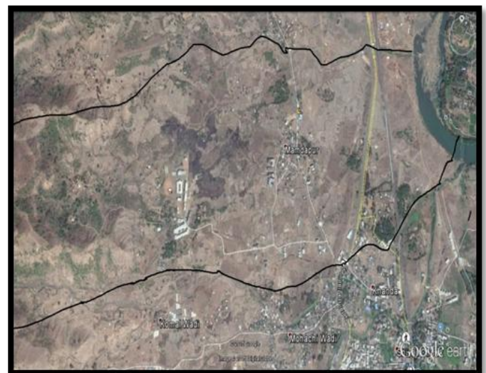
Fig 1: TARGET AREA