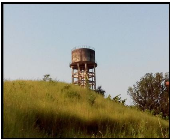
Fig 5: 4,65,000 litres TANK AT MOHACHI VADI

From these tanks daily water is distributed using only gravity method to the villages mentioned above.