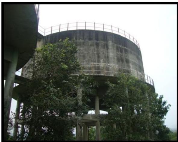
Fig 4: 2 TANKS OF 10,00,000 litres EACH TO STORE WATER NEAR THE TREATMENT PLANT

Later on the treated water is stored in 2 tanks having a capacity of 10 Lakh liters each using 75hp pumps. These tanks are located just above the treatment plant at an higher altitude.