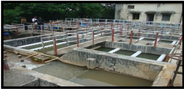
Fig 3: WATER TREATMENT PLANT AT BORLE VILLAGE

Later on the treated water is stored in 2 tanks having a capacity of 10 Lakh liters each using 75hp pumps. These tanks are located just above the treatment plant at an higher altitude.