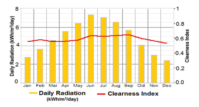
Fig 3: Wind and Solar Resource