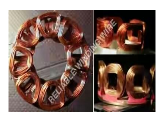
Fig.4- copper winding