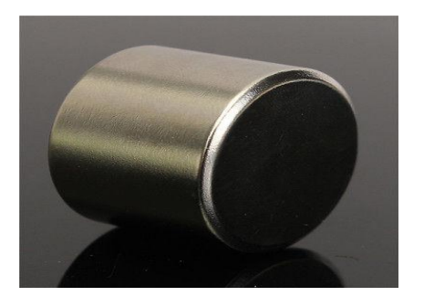
Fig.6- cylindrical magnet