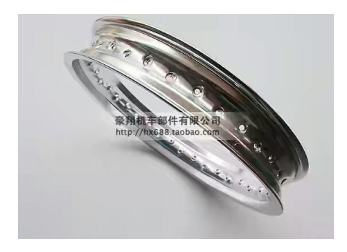
Fig.2- Ring of wheel