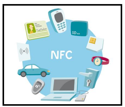
Fig -3: Components of an NFC ecosystem

Volume: 03 Issue: 06 | June-2016 www.irjet.net p-ISSN: 2395-0072