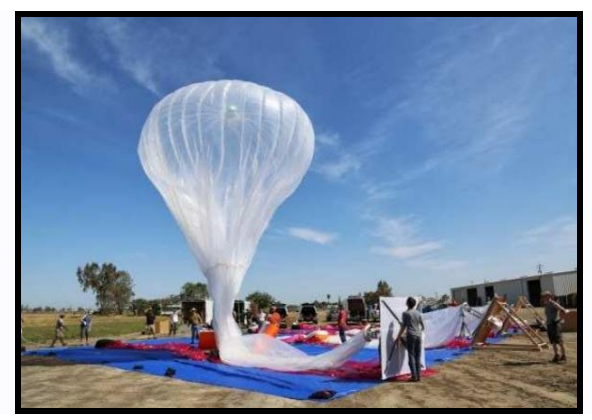
Fig -2: Google project Loon

A new project, the project Loon is proposed by Google that can provide internet access to remote and rural areas. It was launched in 2013. The Loon network, balloons travel around the Earth and bring access points to the users who cannot connect directly to the global wired Internet. Deployment of base stations for every location on the Earth seems to be impossible. It is a concept of providing Internet from the sky. Balloon network is formed in the sky that will transmit signals to nearest base stations and ISPs on earth. One balloon can provide connectivity to a ground area about 70 to 80 km in diameter using a wireless communications technology.