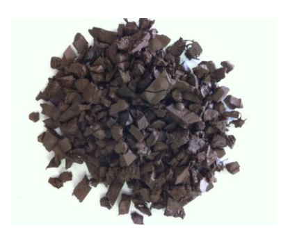
figure 1(Crumb Rubber)

Recycled waste tyre rubber is a promising material in the construction industry due to its lightweight, elasticity, energy absorption, sound and heat insulating properties. In this paper the compressive strength of concrete utilizing waster tyre rubber has been investigated. Recycled waste tyre rubber has been used in this study to replace the fine and course aggregate by weight using different percentages. But in this project only course aggregate can be replace.