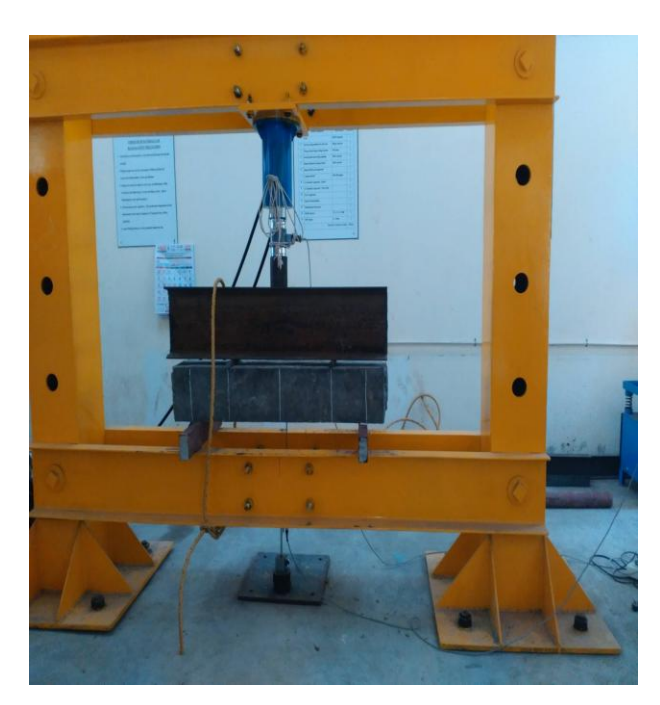
Figure-3 loading frame

Volume: 03 Issue: 06 | June-2016 www.irjet.net p-ISSN: 2395-0072