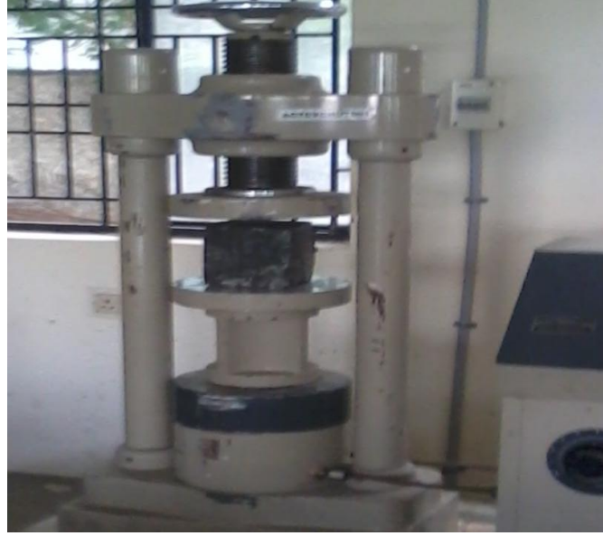
Figure-2 compressive strength testing machine