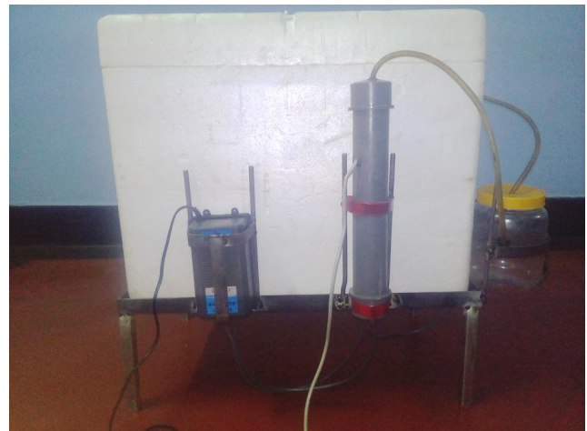
Figure 7. Experimental Setup 1

The air from the air pump is transferred to the heater using pipes of small diameters. A hole of size equal to the diameter of the pipe is made to one end of the heater to transfer air from pump to the heater. As the air coming out of the heater is hot, a pipe that has the ability to withstand high temperature is used to transfer hot air from the heater to the condenser. The pipe from the heater is connected to the storage tank containing sufficient amount of gasoline. The gasoline vapours formed are transferred from the tank to the condenser using small diameter pipes and connected to the coiled copper tubes placed in the condenser. The other end of the copper tube is connected to a small vessel to store the liquid gasoline. All the holes and air gaps are tightly sealed using M seal