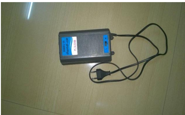
Figure 3. Positive Displacement Pump

A positive displacement air pump is used to pump the vapour from the tank to the condenser. A pump of 0.012MPa pressure, 3.5W power and 2*3.2L/min output is selected for the same.