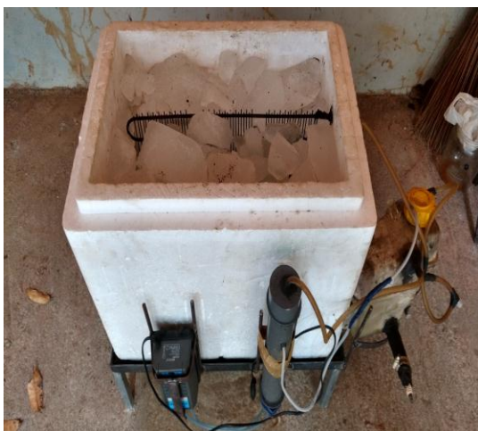
Fig10. Modified Experimental Setup