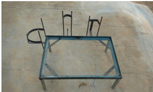
Figure 2. Basic Frame

Determining the design for the basic frame for assembling the components and thus make it more portable. The basic frame is made using scrap iron to make it more economical.