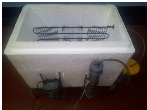
Figure 8. Experimental Setup