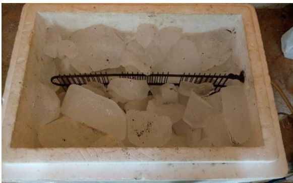
Figure 9. Condensing System

Before starting the experiment 50 ml of gasoline is measured and filled into the copper tube inside the condenser. This process is achieved with the help of a syringe of 20 ml capacity. This is done to eliminate the presence of air molecules inside the tube and to create a negative pressure so that gasoline vapours can be initiated with a flow. After a few minutes the power supply was given. The pump starts to supply the air and it passes to the heater setup. The soldering iron fixed in the heater starts to heat the air. To achieve better heating efficiency the valve place at the outlet of the gasoline storage tank is kept closed. So the air starts to circulate inside the heater and heats at a faster rate. After 20-25 minutes the closed outlet is opened and the main delivery valve is being closed. Now the hot air moves into the copper tube inside the condenser where the primed gasoline is present. After a few minutes say 15 minutes the delivery valve is opened. Now carefully collect the primed gasoline and close the delivery valve again. Now the gasoline vapour inside the condenser starts to condense. Wait for few minutes and slowly open the delivery valve. The condensed gasoline starts to flow through the delivery valve.