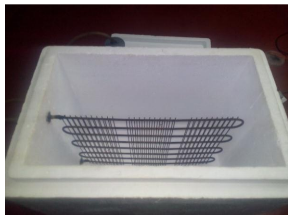
Figure 6. Themocol Box with Coiled Tube

A simple indirect condenser is used to cool the gasoline vapour. The condenser is made using copper tubes and thermocol box packed with ice.