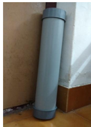
Figure 5. PVC Pipe