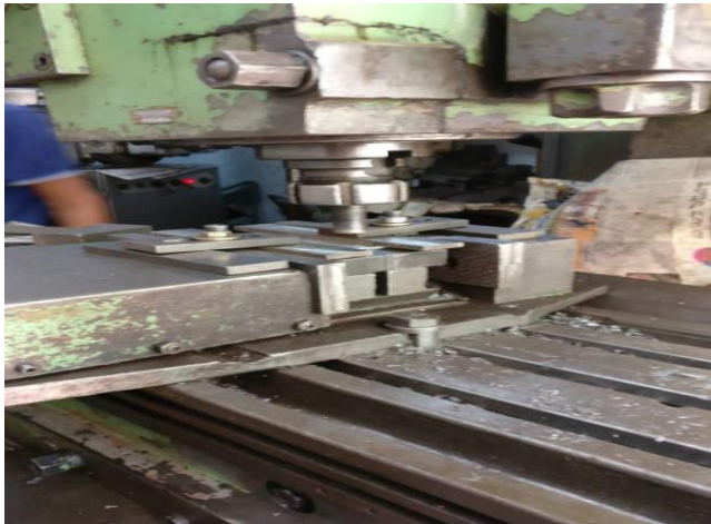
Fig 1. Experimental set up

The depth of cut is also termed as Axial Force required to weld the joint. Based on the thickness of the material this force is selected. There is a limitation of this force based on the machine specifications and thickness of the materials selected, In our case the depth of cut is fixed 3.5 mm.