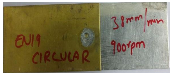
Fig 3:- FSSW of Brass(IS319) to Al(6061-T6)