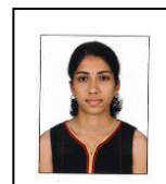
Student, Dept of CS&E, SKIT, Karnataka, India