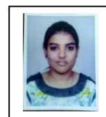
Student, Dept of CS&E, SKIT, Karnataka, India