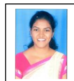
Assistant Professor, Dept of CS&E, SKIT, Karnataka, India