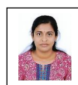
Student, Dept of CS&E, SKIT, Karnataka, India