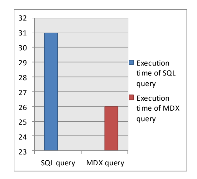
Figure5: Graphical representation of execution time between SQL queries & MDX queries.