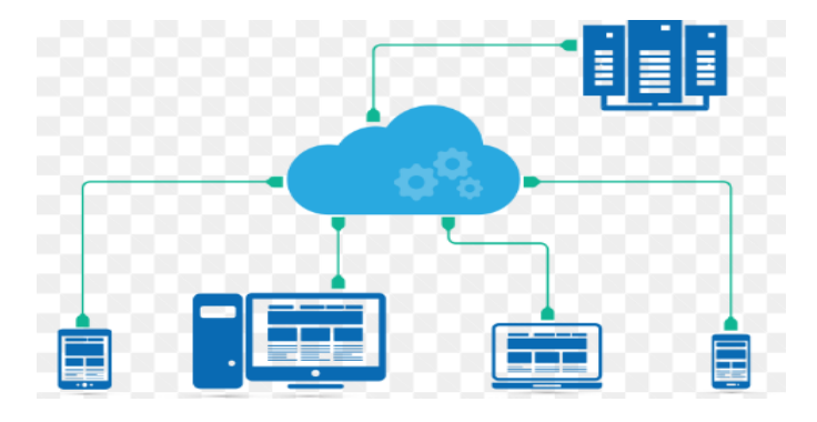
Fig -3: Cloud platform

OpenNebula is additionally an open source cloud benefit structure. It permits the client to send and oversee virtual machines on physical assets and it can set clients server farms or groups to the adaptable virtual framework that can consequently acclimate to the change of the administration stack. The essential distinction of OpenNebula and aura is that radiance actualizes remote interface in light of EC2 or WSRF through which client can process all security related issues, while OpenNebula does not. OpenNebula is likewise an open and adaptable virtual foundation administration apparatus, which can use to synchronize the capacity, organize and virtual systems and let clients powerfully convey benefits on the dispersed framework as per the assignment techniques for the server farm and remote cloud assets. Through the inside interfaces and OpenNebula server farm condition, clients can without much of a stretch send any sorts of swarms. [4]