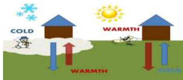
Fig 3: Geothermal Heating and Cooling

Geothermal Heating and Cooling systems provide space conditioning heating, cooling and humidity control. Geothermal heating and cooling systems work by moving heat, rather than by converting chemical energy to heat. Every geothermal heating and cooling systems has three major subsystems or parts: a geothermal heat pump to move heat between the building and the fluid in the earth connection, an earth connection for transferring heat between its fluid and the earth, and a distribution subsystem for delivering heating or cooling to the building.