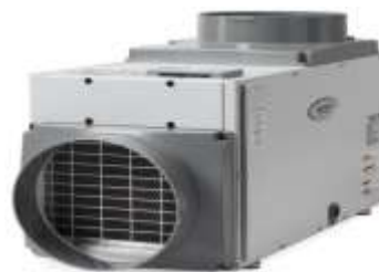
Fig 4: Ventilator with Dehumidifier

This ventilator removes excessive moisture from ventilated air in buildings located in areas with mild temperatures and high humidity in winter. Without this ventilator the air conditioner has to do all the work of conditioning the humid outdoor air, which can lead to over cooling and wasteful energy management. The ventilator removes humidity from the ventilated air before it reaches the building's living space.