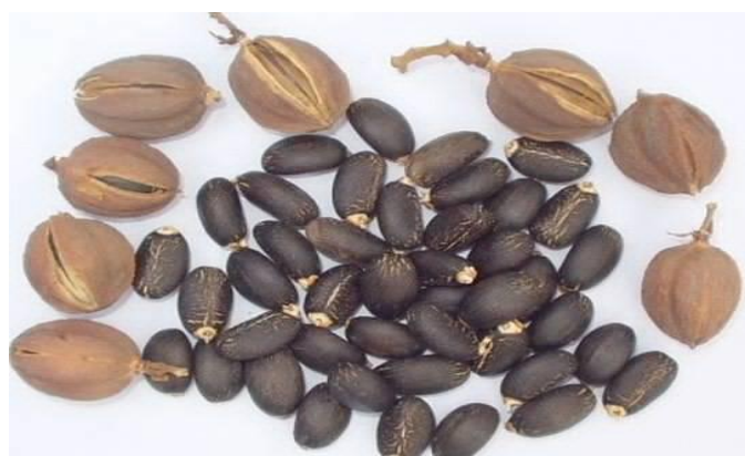
Fig.3 Jatropha plant Seed