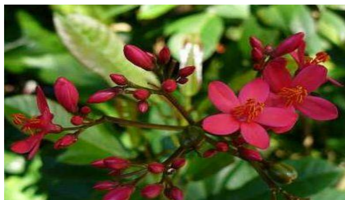
Fig.2 Jatropha plant flower

The Jatropha oil has higher cetane number compared to diesel. It's an honest various fuel requiring no engine modification. However most non-edible oils, Jatropha contain the high level of carboxylic acid that is inexpedient because it lower of Biodiesel. Table 1.1 shows the Jatropha Oil Chemical Composition.