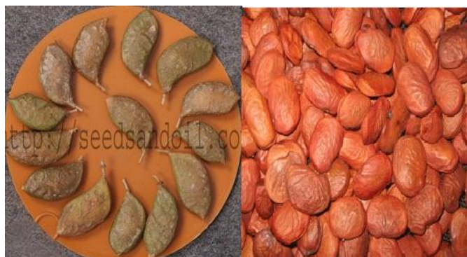
Fig.4 Karanja seed

mix with diesel and n-butanol and located that kinematic viciousness of karanja oil was 10.9 times conjointly than that of diesel oil that reduced with the rise in diesel quantity within the mix. Karanja oil flash and fireplace purpose and its ethyl group organic compound were found to be bigger than 378K that is simple to storage and handling.