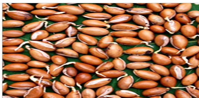
Fig.5 mahua plant flower & seed