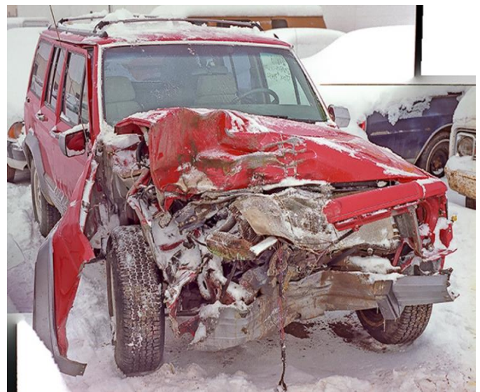
Figure 1. Front-end damage from head-on impact with separated dual heavy truck wheels.

When a wheel separation occurs on a highway, the separated wheel is hardly slowed down. The approach speed between the now bouncing projectile and oncoming vehicles can easily exceed 100 mph. Figure 1 shows damage to an SUV that was hit head on by a pair of escaped heavy truck wheels.