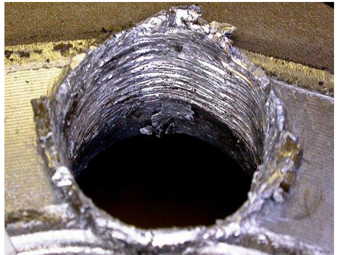
Fig -2.1: Wheel hole damage after 21 days of installation.

Figure 3 shows a badly corroded wheel which was separated because the rust deposits were not cleaned off properly before re-installation of the wheel. There are ample warnings for wheel installers to clean wheel surfaces before re-installing a wheel to prevent corrosion and dirt from imperiling the clamping force. Cleaning the wheel interfaces is normally done with a wire brush just before installation. This mistake can be dangerous as the rust can easily reach the nuts and the studs, and they can be easily loosened due to the rust deposits and the wheel can be separated.