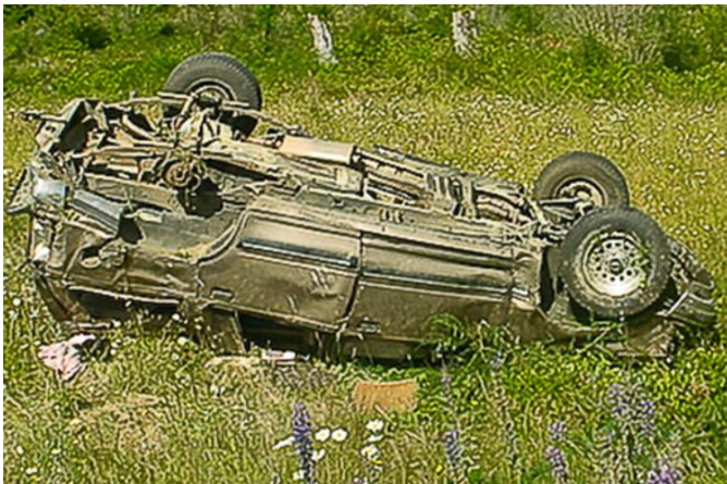
Figure 4. Eyewitnesses observed the left rear wheel separate from this SUV before it lost control and rolled. All five nuts were missing from the wheel studs of the left rear wheel.