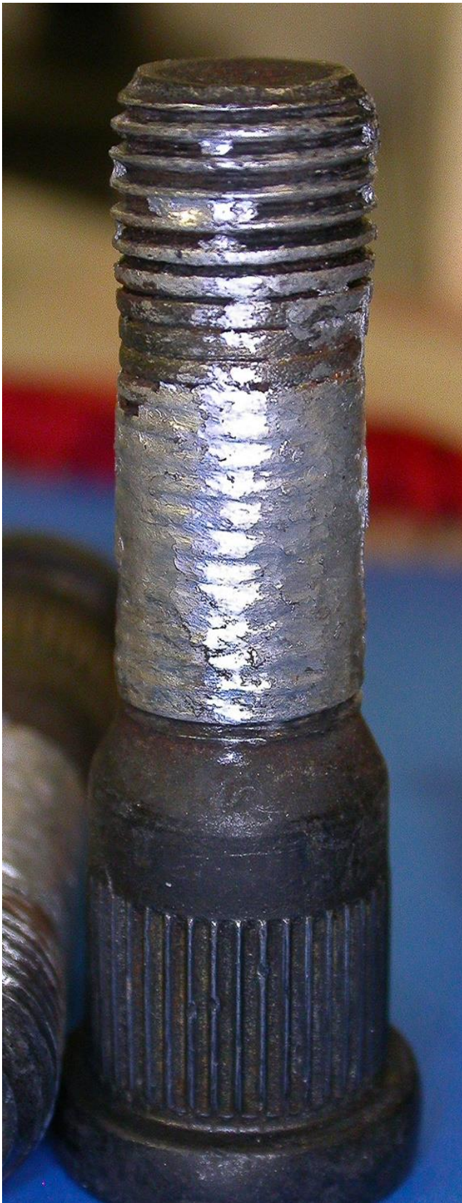
Fig -2: Wheel stud.