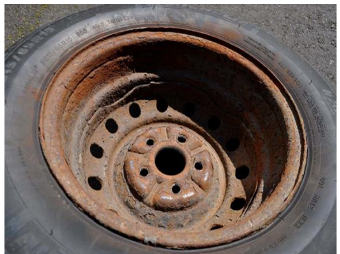
Fig -3: Badly corroded disc wheel.

Figure 3 shows a badly corroded wheel which was separated because the rust deposits were not cleaned off properly before re-installation of the wheel. There are ample warnings for wheel installers to clean wheel surfaces before re-installing a wheel to prevent corrosion and dirt from imperiling the clamping force. Cleaning the wheel interfaces is normally done with a wire brush just before installation. This mistake can be dangerous as the rust can easily reach the nuts and the studs, and they can be easily loosened due to the rust deposits and the wheel can be separated.