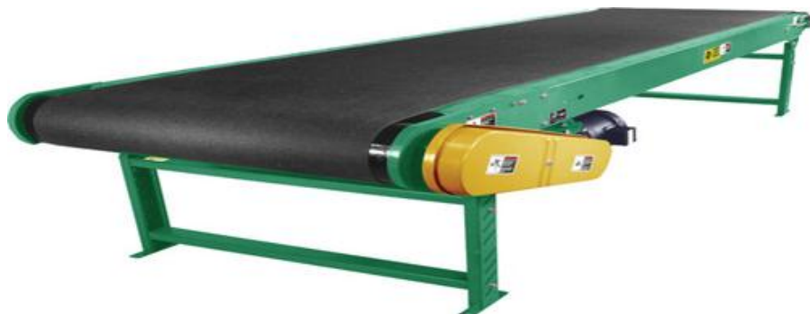
Fig-10 Belt conveyor system