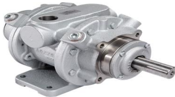
Fig-9 Air motor

A pneumatic motor is a mechanism by which compressed air is taken and converted into energy that is then used for mechanical work. Pneumatic motors are also capable of rotating motion in addition to linear motion.