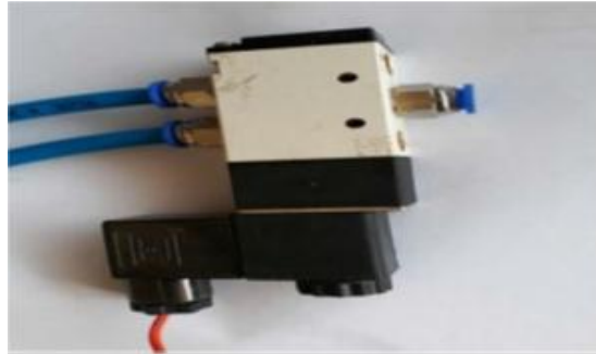
Fig-8 Solenoid valve

Solenoid valve is a control device that either shuts down or makes fluid flow once electrically energized or de-energized. The actuator is an electromagnet in the shape. Once energized, a magnetic field builds up that pushes against the movement of a spring a plunger or pivoting armature.