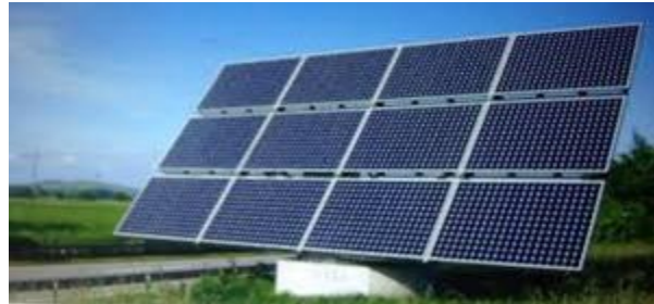
Fig-3 solar panels

Solar photovoltaic panels consume sunlight as a source of energy for direct electricity generation