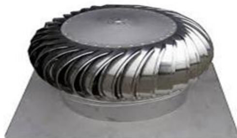
Fig-2 roof top wind turbine ventilator