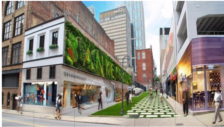
Fig -1: Perfect Public Space [17]

It is a major test as pointed out that in the pioneer neighborhoods, it's difficult to express one's feeling of personality. Style cause spots to appear to be indistinguishable, yet they probably won't be a similar time.