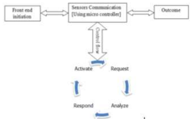
Figure 2: IoT schema representation