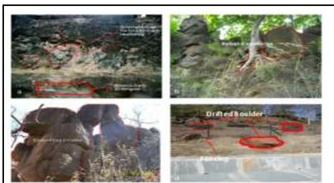
Figure 3: Various Types of Boulders in the Study Area

M.K.Ansari [2] et.al conducted various tests on rock fall hazard to overcome the damage caused to the caves and for the safety of the tourists. Following tests were performed for studying the nature of rocks and their assessment: Barton-Bandis model in universal distinct element code from which test was done to obtain the information on detached rock mass; Rigorous Field study and laboratory experiment for rock simulation parameters; Rock fall 4.0 program for calculating maximum bounce heights total kinetic energies and translational velocities of the falling block of different weights shown in Fig 6. Their main focus of the survey was to study the description of slope geometry that was affected by rock falls and rock mass property. They have found that the reason for rock fall was due to downward forces acting on the rock mass changes which were due to pore pressure weathering of material, freezing/ thawing process and root growth with rock mass. As per the data obtained from the assessment they have concluded that the maximum of 917.66kJ kinetic energy for 2000kg mass and result showed that the kinetic energy was directly proportional to mass of falling rocks. The maximum translational velocity was found to be 40m/s and travelling up to a distance of 83m. Finally, they have concluded that the barrier capacity of 325kJ was calculated shown in Fig5 for 2000kg block of height of 50m to reduce the impact of rock fall.