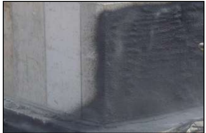
Figure 11: Bentonite Clay

To control seepage in mainly in profile P3 Bentonite shown in Fig11 clay minerals can be used near the drain path as indicated by red line in Fig8. Bentonite becomes hydrated with the moisture naturally present in soil and acts as impermeable barrier that absorbs and expels water. Hence an effort can be made to protect the world heritage site.