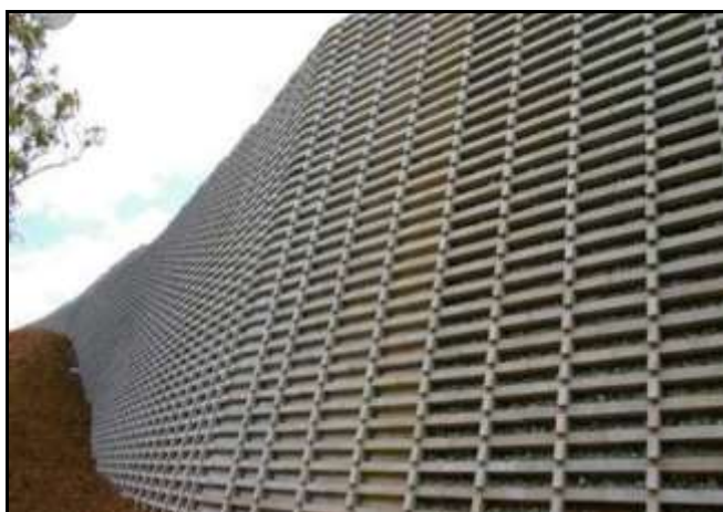
Figure 10: Crib Wall