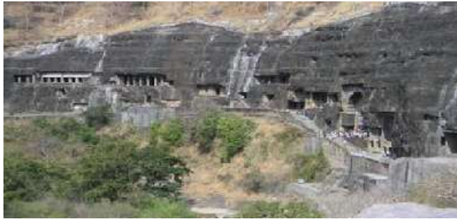
Figure 2: Ajanta Caves, the World Heritage Site