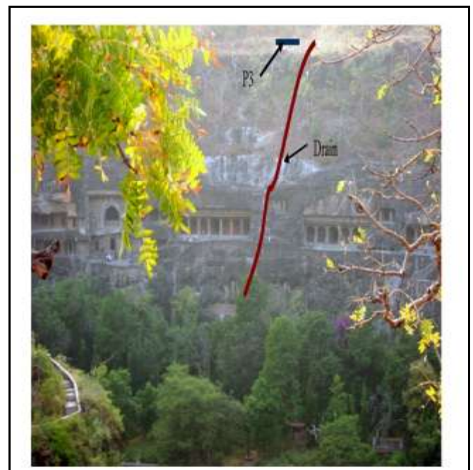
Figure 8: Schematic Position of Profile P3 with respect to the Drain