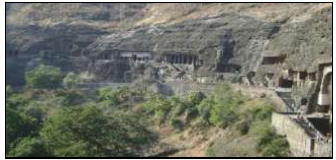
Figure 4: Side View of Ajanta Caves