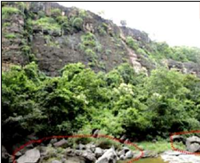
Figure 6: Various Sizes of Blocks Fallen down from Top are indicated by Dotted Area