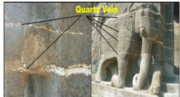
Figure 7: Quartz Veins in Basalt at Site Area