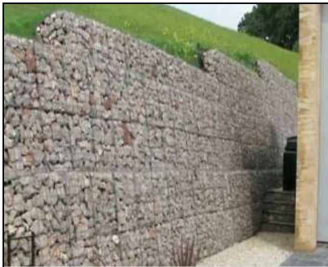
Figure 9: Gabion Wall