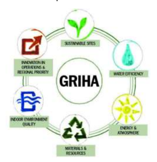
Figure 2-GRIHA Credit Categories

GRIHA was developed as an indigenous building rating system, particularly to address and assess non-air conditioned or partially air conditioned buildings. GRIHA has been developed to rate commercial, institutional and residential buildings in India emphasizing national environmental concerns, regional climatic conditions, and indigenous solutions. GRIHA stresses passive solar techniques for optimizing visual and thermal comfort indoors, and encourages the use of refrigeration-based and energy-demanding air conditioning systems only in cases of extreme thermal discomfort. GRIHA integrates all relevant Indian codes and standards for buildings and acts as a tool to facilitate implementation of the same.