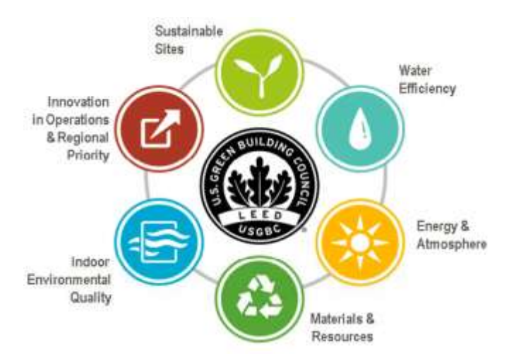
Figure 1-LEED Credit Categories

considered to be one of the most successful green building rating systems in the world because of its early market penetration and adoption by professionals. Since the CII-Godrej GBC achieved the prestigious LEED rating for its own centre at Hyderabad in 2003, the Green building movement has gained tremendous momentum. The Platinum rating awarded for this building sparked off considerable enthusiasm in the country. This rating system is based on accepted energy and environmental principles and strikes a balance between known established practices and emerging concepts. It is performance oriented, wherein credits are earned for satisfying criteria addressing specific environmental impacts inherent in the design and construction. Different levels of green building certification are awarded based on the total credits earned. The system is designed to be comprehensive in scope, yet simple in application. The specific credits in the rating system provide guidelines for the design and construction of buildings of all sizes in both the public and private sectors. The intent of LEED 2011 for India is to assist in the creation of high performance, healthful, durable, affordable and environmentally sound commercial and institutional buildings.