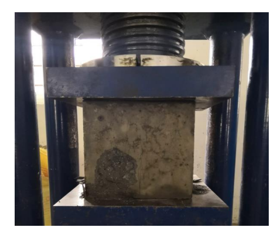
Fig -1: Compressive strength test on cube

Chart-1: Compressive strength test results comparison chart