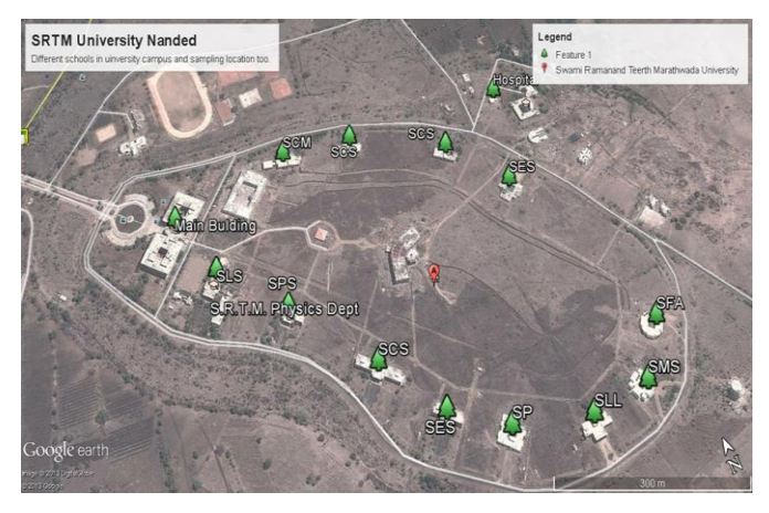
Fig. 1 Showing the Different Sampling Locations of Schools in University campus Area

Nanded. Significant essential changes in the university have been observed. Due to migration of country faculties to urban areas for their jobs. Increasing number of circulating vehicles in university campus area by students as well as by staff members. Similarly, the increasing activities in civil construction in order to build new subdivisions for the new inhabitants in the campus area.