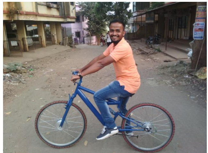
Figure - 2: E-BIKE photo.

The microcontroller receives information about the motor position (rotor angle), via signals generated by three Hall position sensors contained within the motor. Using this data, the microcontroller makes use of a simple commutation table and switches the six power MOSFET transistors which drive the BLDC motor. Internet based literature (images only) suggests that BLDC controllers used in commercial E-Bikes contain linear power supply. This is a main issue regarding power efficiency, due to the luminous power loss as heat in the internal power supply. One of the improvements this design brings is the use of a DC to DC step down converter, which greatly lowers the power consumption of the module and reduces the ambient temperature in the case of the module. The second important issue is that considering the fact that the electronics on an E-Bike must be housed in a water-proof enclosure. The user of the e-Bike receives relevant data (e.g. instantaneous speed, battery state of charging) from the motor controller via Bluetooth protocol and can view the data on a GUI (graphical user interface), i.e. on a smartphone.