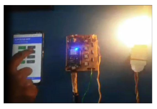
Fig-6 : Light is Turned ON and OFF by smartphone