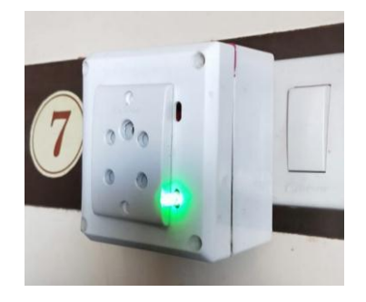
Fig-7: Complete smart plug prototype